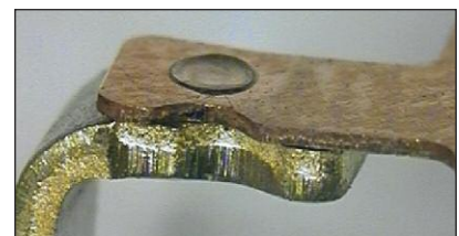
Conductive terminal attachment