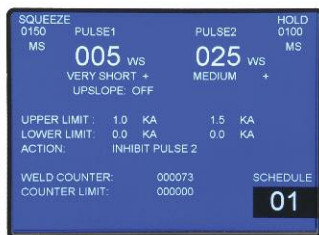
LIMITS/ COUNTER screen