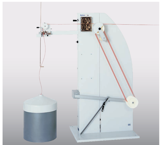
▲ Komax 106 Active feeding system

The Komax 106 is an active feeding system. It can feed from loose coils, wire drums, Conipacks or central wire storage systems. A control algorithm with an automatic learning mode allows the wire processing machine to run at high capacity while the wire bundle is de-reeled at a reduced rate of acceleration and a constant speed. This ensures that feeding is carried out in a gentle, reliable process. Besides wire-end and knot detection, the feed system also has a function for setting a pull-force limit. The Komax 106 is compatible with all automatic processing machines.