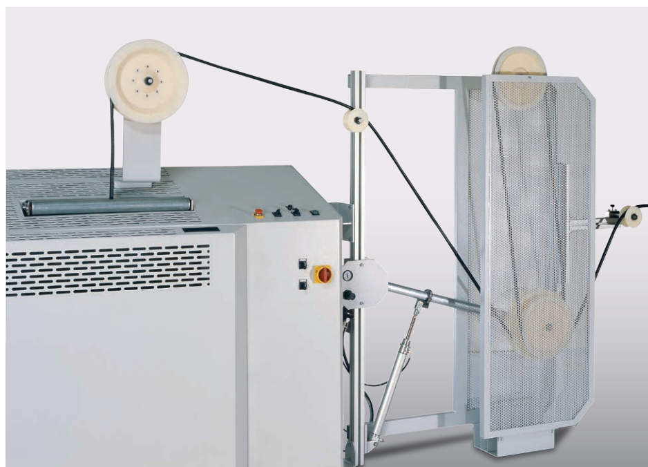
▲ ads 123 With optional Storage-Arm-Down and Down-Plus