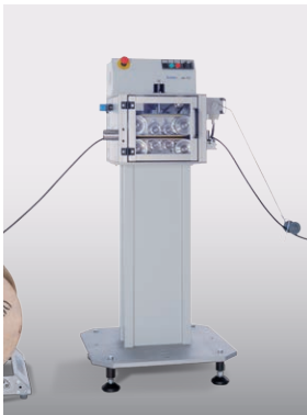
◀ ads 112 Wire pull machine with regulating arm