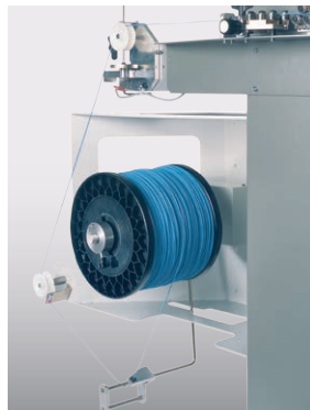
▲ Komax 104 passive de-reeler on Gamma