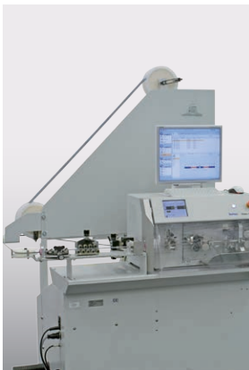
▲ ads 119 With piggyback option