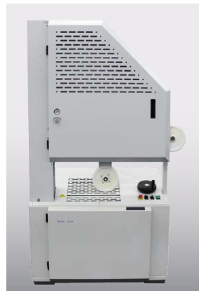
▲ ads 119 active wire delivery system