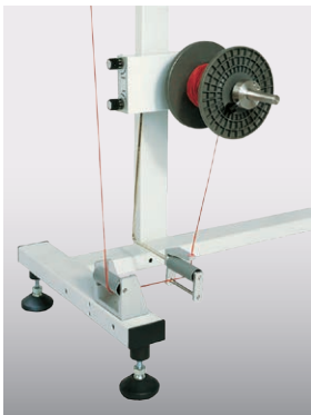
▲ Komax 104 Passive de-reeler

The Komax 104 is designed for use as a passive roller support for small wire reels. The de-reeler is equipped with a finely adjustable rope brake and can accommodate wire reels with an outside diameter of up to 270mm.