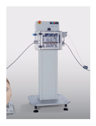
ads 112 Wire pull machine with regulating arm