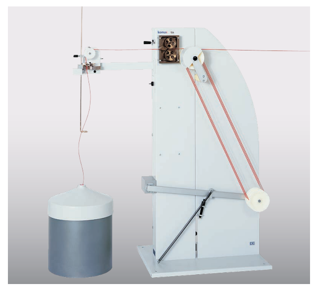
▲ Komax 106 Active feeding system

The Komax 106 is an active feeding system. It can feed from loose coils, wire drums, Conipacks or central wire storage systems. A control algorithm with an automatic learning mode allows the wire processing machine to run at high capacity while the wire bundle is de-reeled at a reduced rate of acceleration and a constant speed. This ensures that feeding is carried out in a gentle, reliable process. Besides wire-end and knot detection, the feed system also has a function for setting a pull-force limit. The Komax 106 is compatible with all automatic processing machines.