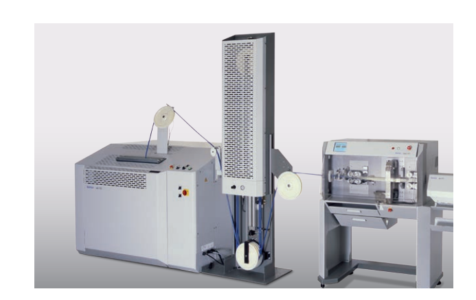
ads 123 ► Wire delivery system

Thin, flexible stranded wires and cable as well as conductors up to 35 mm in diameter can run at high rates of speed and acceleration. A roller rotating with the unit immediately detects any problems occurring in the de-reeling of the wire.