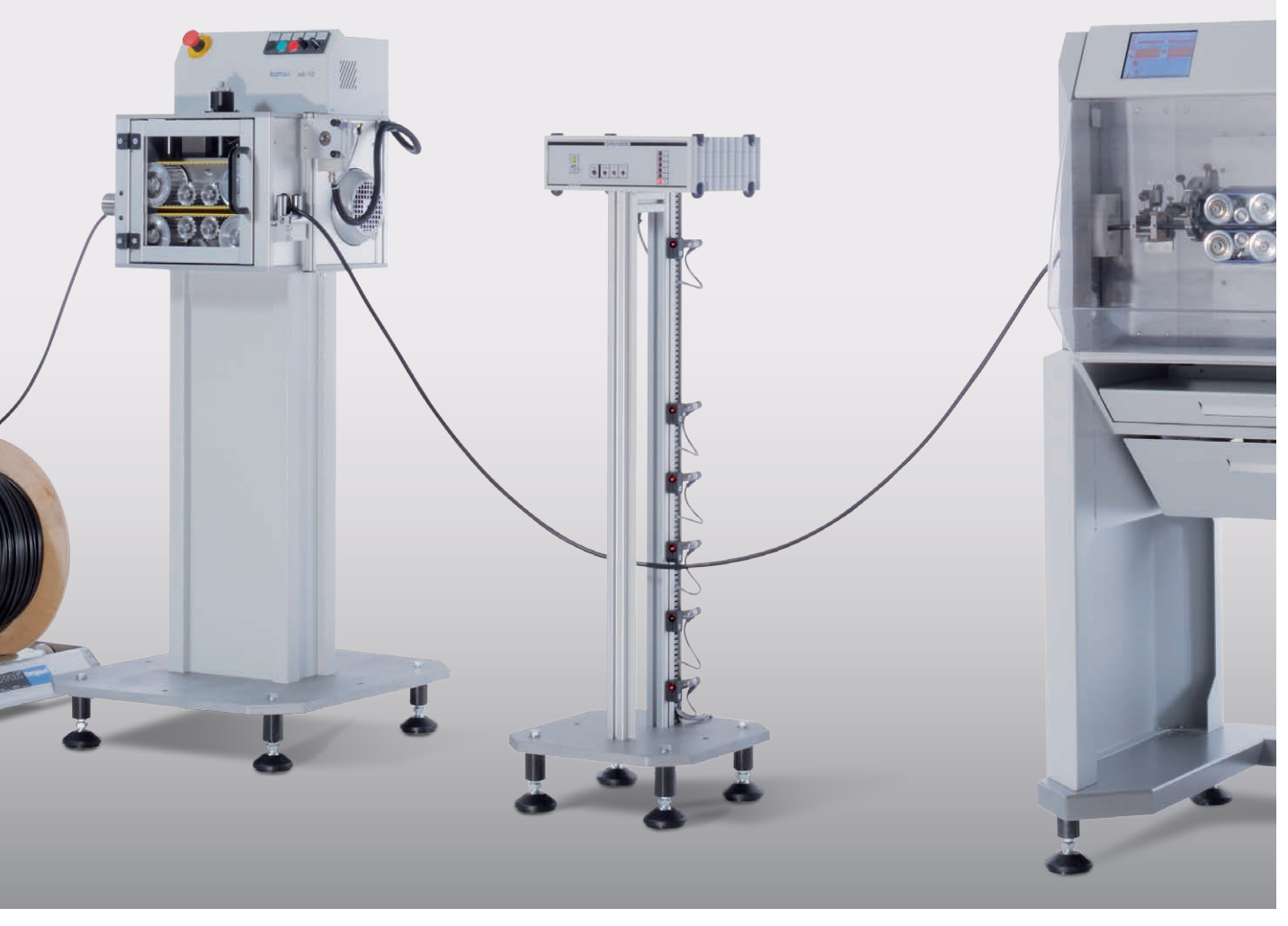
▲ ads 112 Wire pull machine with DHS 1000D wire sage control unit on a Kappa 350