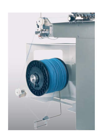
Komax 104 passive de-reeler on Gamma