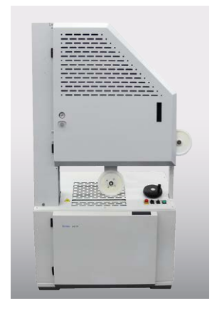
▲ ads 119 active wire delivery system