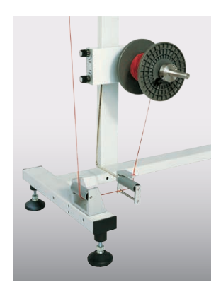
▲ Komax 104 Passive de-reeler

The Komax 104 is designed for use as a passive roller support for small wire reels. The de-reeler is equipped with a finely adjustable rope brake and can accommodate wire reels with an outside diameter of up to 270 mm.