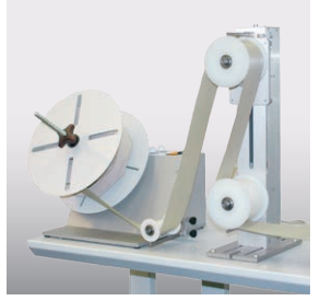
▲ ads 115 With flat cable

The ads 115 wire delivery system is a compact table model ideal for flexible use in tandem with Komax automatic cut-and-strip machines. The de-reeling speed is controlled continuously and adapts to wire requirements. The direction of rotation can be changed if need be. This feature enables cables to be reeled off or rewound. This model accommodates reels up to 400 mm in diameter, loose coils and flat cable rolls.