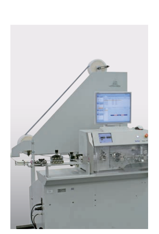
ads 119 With piggyback option