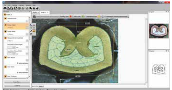
The most important measured variables can be measured automatically and manually.