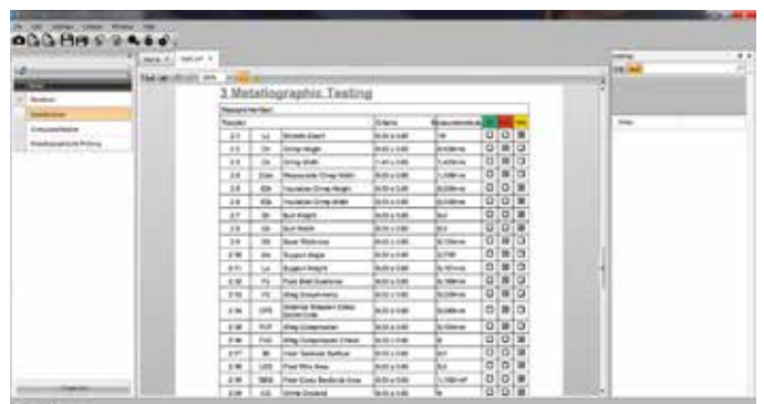
The test results can be produced as individual reports.