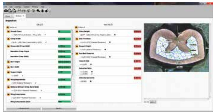
Specific additions can be made to the basic measurement functions (distance, area, counter, angle).

SmartVision is easy to integrate in the production system of companies: You can freely configure system authorizations, the report templates and other standards. The program also offers various language add-ons. It provides fast-response support for implementation and use, so companies profit quickly from the SmartVision software.